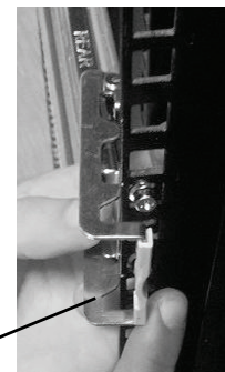
Rear latch handle